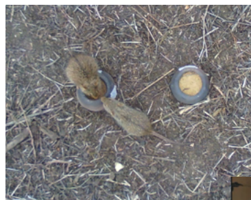
Camera trap captured rats during field monitoring of bio-rodenticide intake.