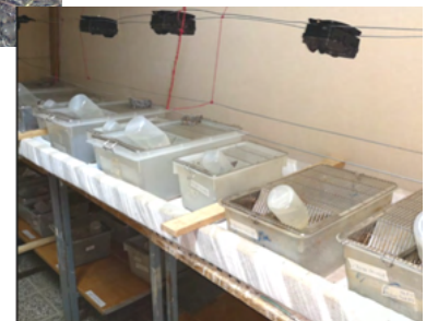
Lab setup of rat cages and camera traps to monitor intake and efficacy of bio-rodenticide.