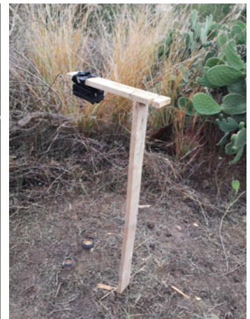
Camera trap set in the field to monitor bio-rodenticide intake