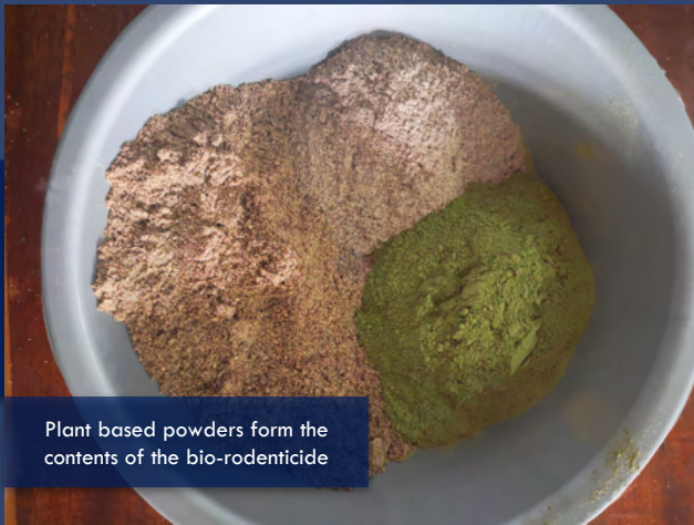
Plant based powders form the contents of the bio-rodenticide