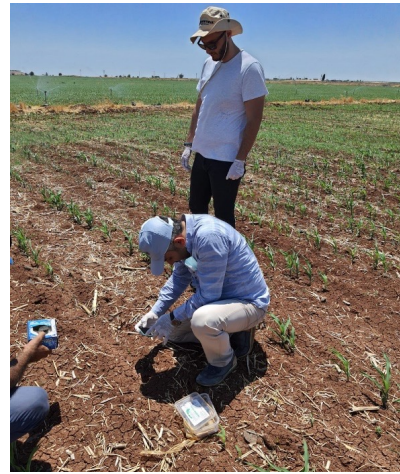
Inspection of rodent seedling damages

To understand the magnitude of rodent inflicted damages to field crops (including large-scale plantations), we use multiple approaches, including the tiller-count method and active burrow count.