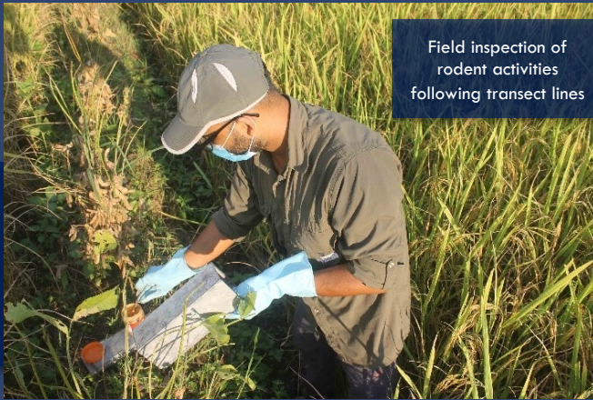
Field inspection of rodent activities following transect lines