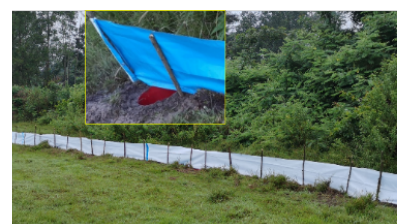
A bucket pitfall trapping line for rodent assessment

Pitfall trapping is widely used to examine species occurrence during surveys and inspection, assess spatial distribution patterns, compare relative abundance in different micro-habitats, study daily activity rhythms, and seasonal occurrences. It follows the transect method.