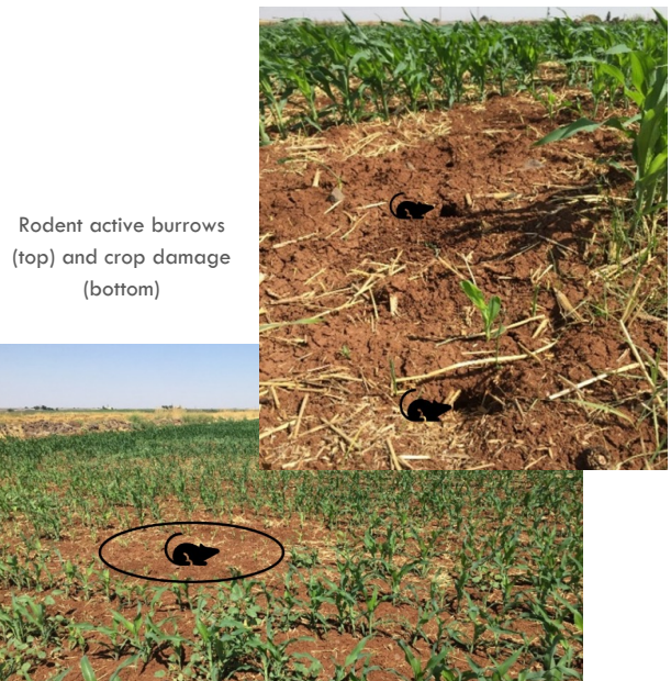
Rodent active burrows (top) and crop damage (bottom)

Counts of active burrow entrances have been positively correlated with most recent densities of burrowing rodents and used as a proxy to density assessment where CMR technique would be cost ineffective and/or challenging. To increase data accuracy on population density, burrow count method should be supplemented by other density estimation method/s. If censused across different habitat types, burrow count method can also provide useful data on species habitat use.