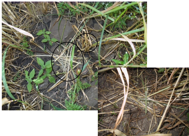
Rodent damaged wheat tillers. Note the characteristic oblique tiller cut of rodents

The tiller-count method aims to quantify the proportion of crop damaged by rodents and the extent of economic loss. It uses the grid method to lay-out quadrants in the field, after which for each quadrant the cut and uncut stems are counted, so as to record type and extent of damages. In crops such as wheat, barley and rice, this method is repeated at least 3 times over a growing season to cover the different growth stages of the crop.