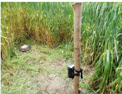
Infrared motion detector camera trap set in wheat field

Camera traps are effective non-invasive sensory methods used for rodent assessment for collecting vital data on taxonomy, biology, behaviour, and ecology. These motion-detection cameras will detect rodents as they move and capture the animals in video/picture with infrared vision for night activity.