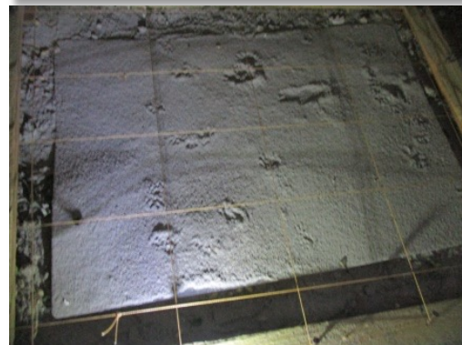
Examples of locally made rodent tracking tiles